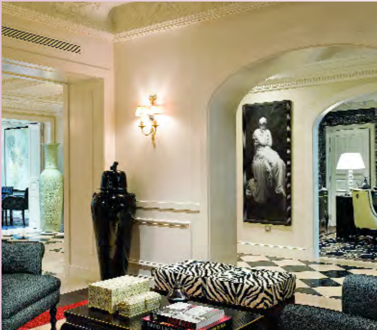
Clockwise from top: The living wall at L'Atelier de Joël Robuchon, Las Vegas; dining at Le Pré Catalan in Paris; a suite sitting area at the Grand Hotel du Lac in Lake Geneva, Switzerland; and Hotel Keppler's lobby. Opposite page: A guestroom at the luxurious Four Seasons Hotel George V.